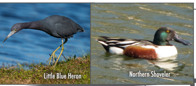
Little Blue Heron